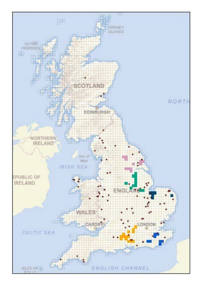
Figure 1. A map of England showing the locations of the 10 kilometre squares in each of the five Regions containing the barn owl nest sites surveyed in 2015. The location of the barn owls obtained by CEH for the CRRU liver residue analysis survey in the same year are also presented (red diamonds).

(Region 1 = pink; Region 2 = purple; Region 3 = yellow; Region 4 = blue; Region 5 = green).